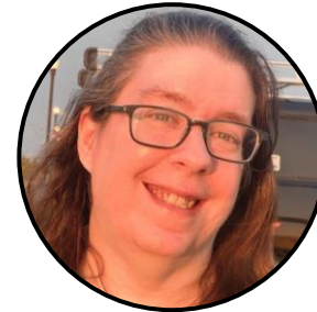
Marneena Evans Capacity Building Center for Tribes