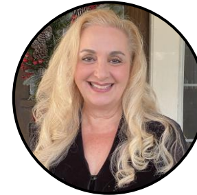
Cheryl Montoya Capacity Building Center for Tribes